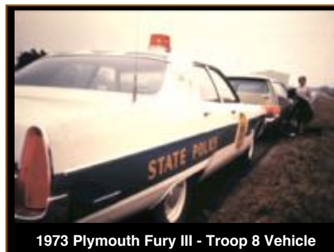
1973 Plymouth Fury III - Troop 8 Vehicle